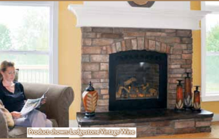
Product shown: LedgeStone Vintage Wine