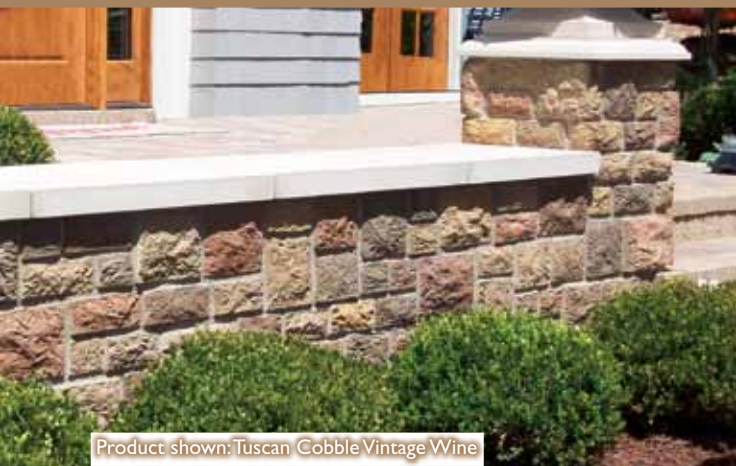
Product shown: Tuscan Cobble Vintage Wine

Bring warmth and character to any part of your home: the kitchen, basement — even an outdoor living space.