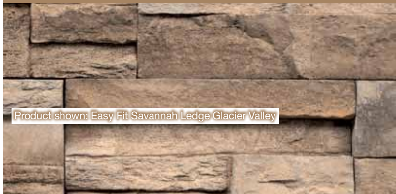
Product shown: Easy Fit Savannah Ledge Glacier Valley