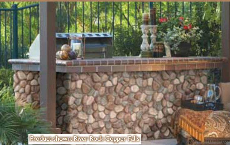
Product shown: River Rock Copper Falls

ProStone® Veneer is an affordable way to turn an ordinary room into a place you want to spend more time. A real living room.