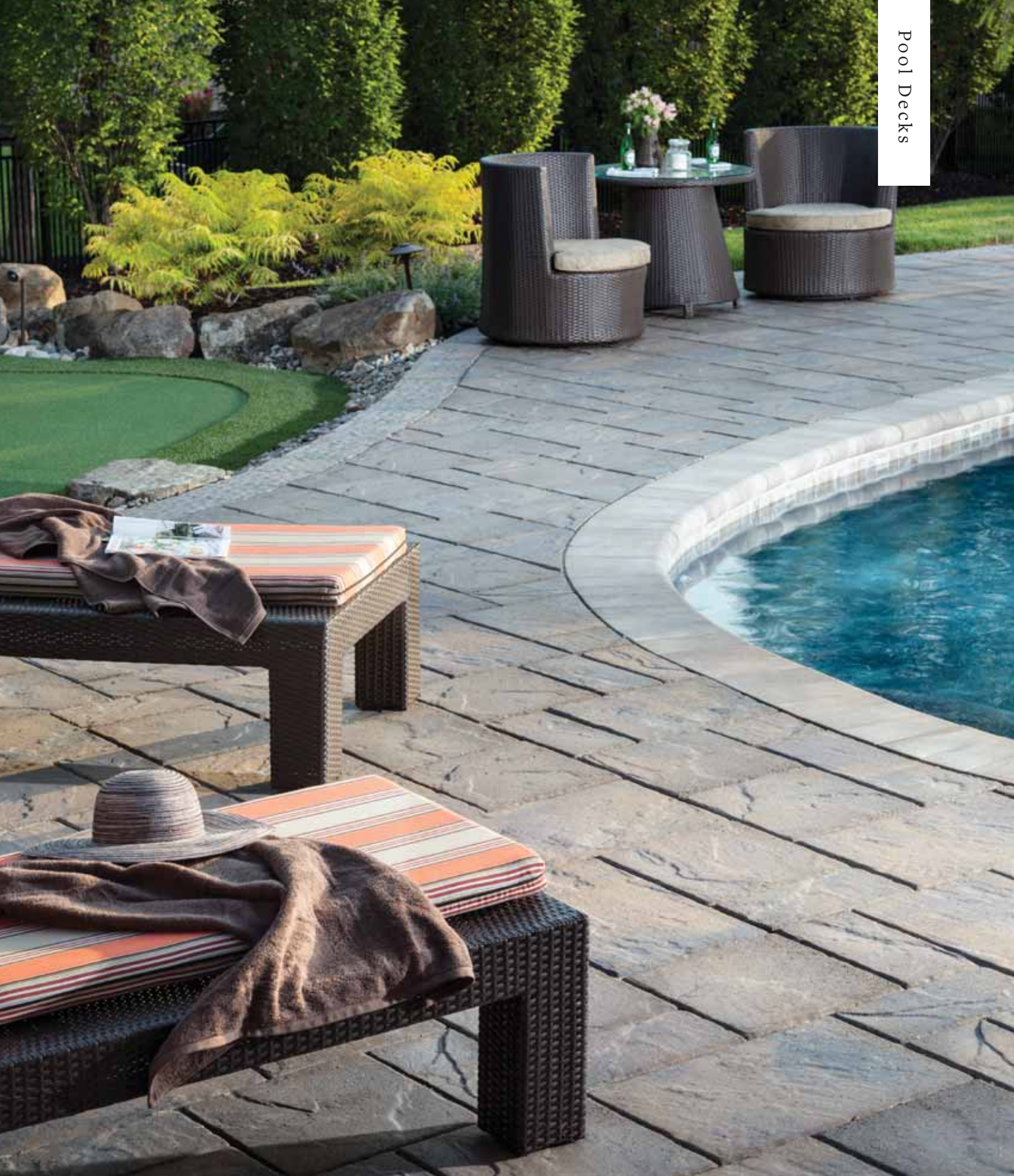
Lafitt™ Rustic Slab/ Bullnose Coping