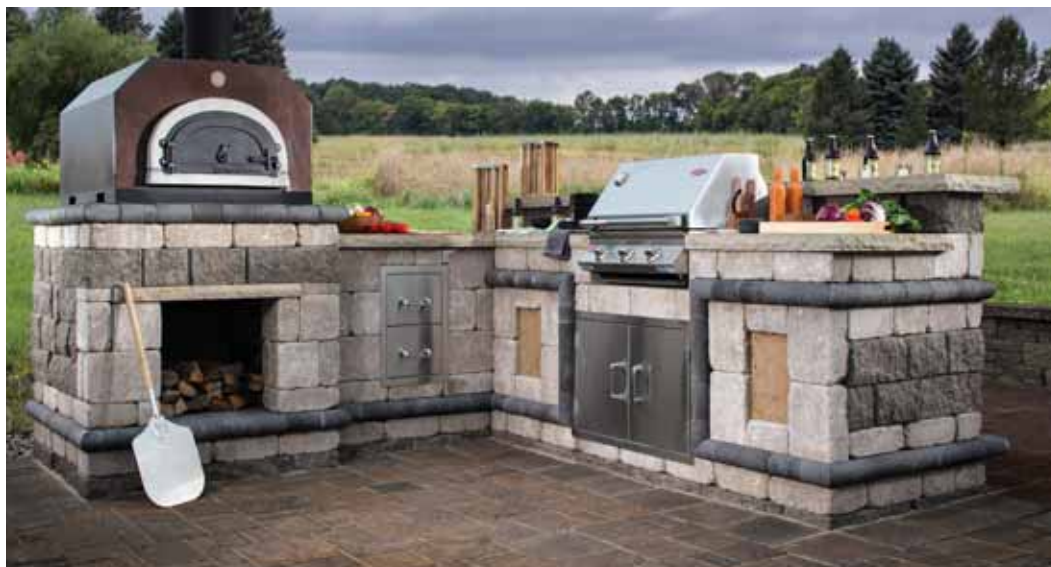
Urbana® Stone/ Weston Stone®/ Bullnose Coping/ Stationary Etna Belgard Brick Oven