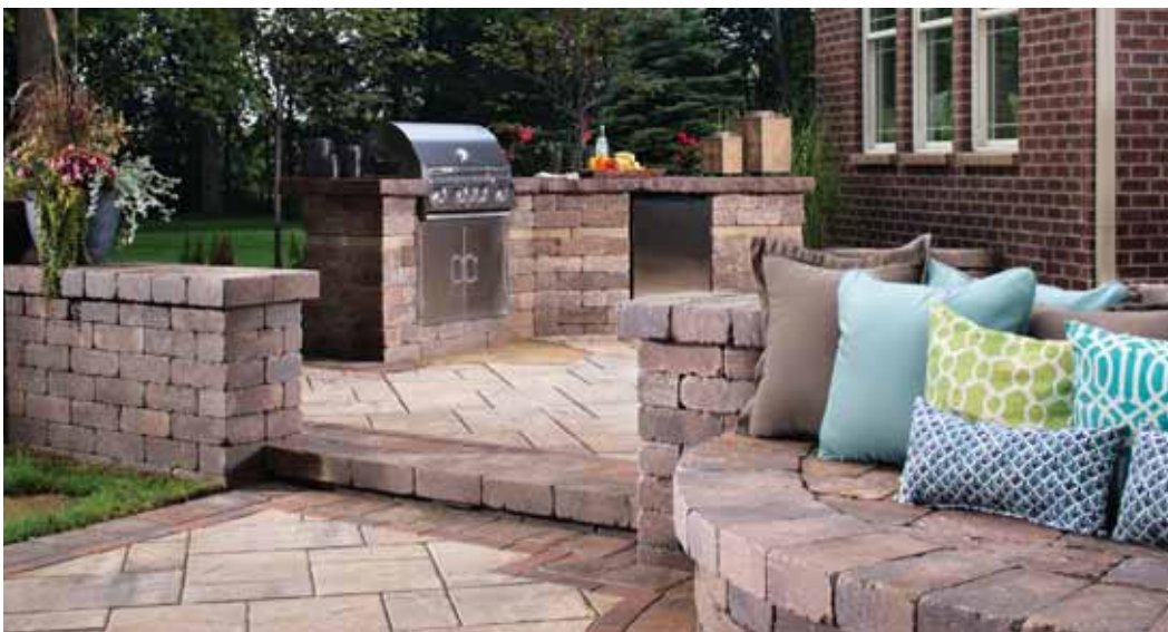
Lafitt™ Rustic Slab/ Weston Stone®/ Dublin Cobble® Large Square with Holland Stone Accents