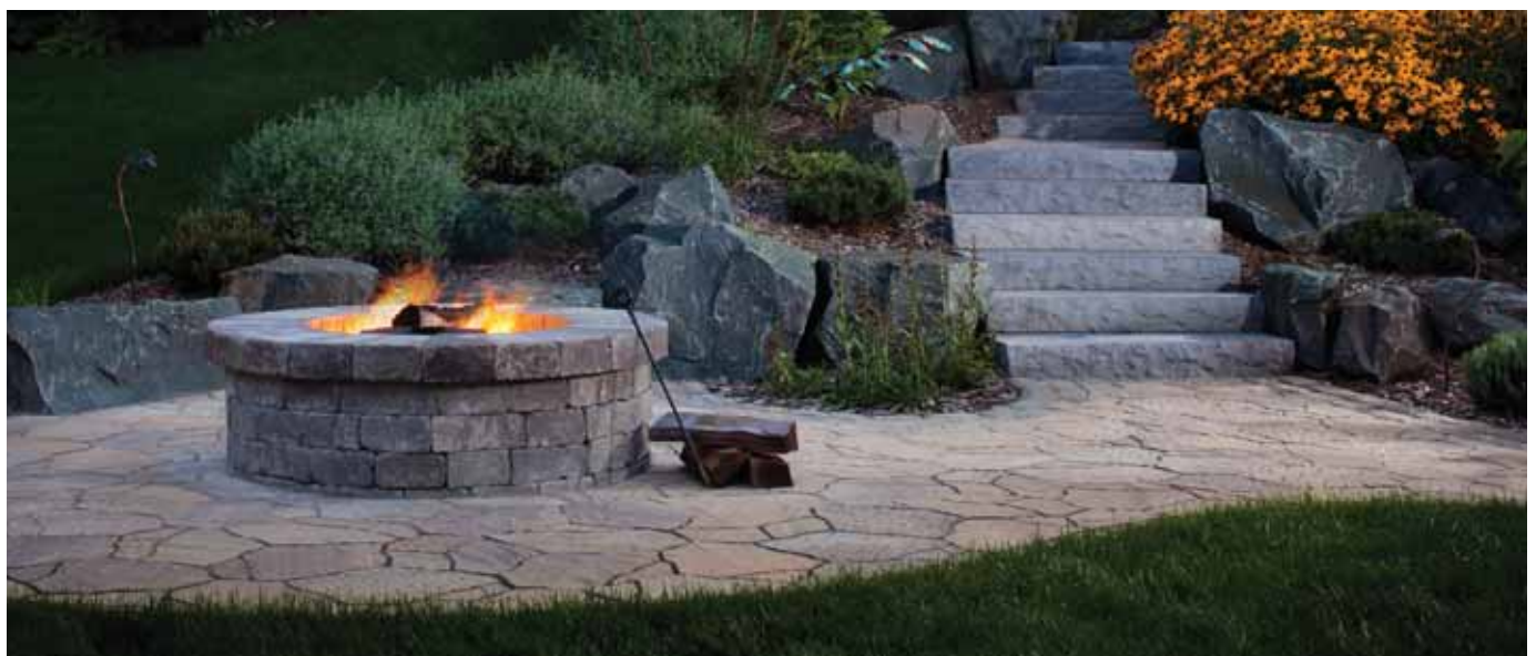
Mega-Arbel®/ Weston Stone®