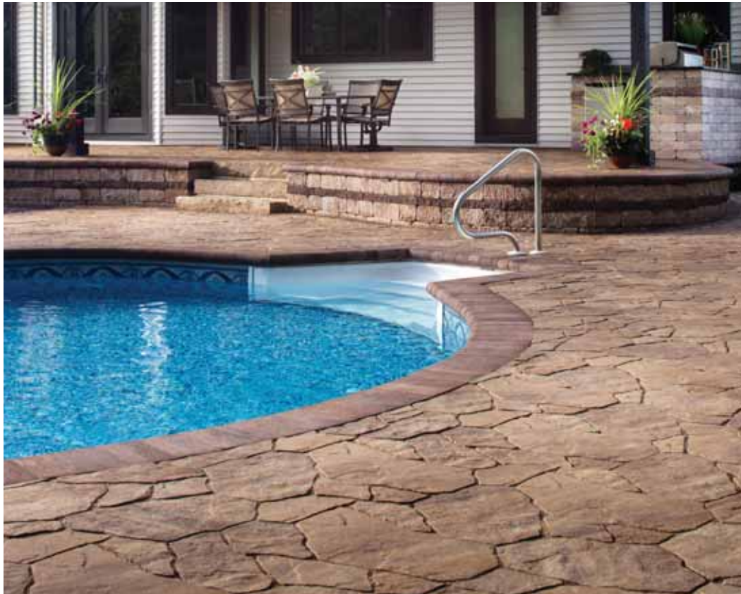
Mega-Libre™ Slab/ Bullnose Coping/ Wellington Wall™/ Weston Stone®