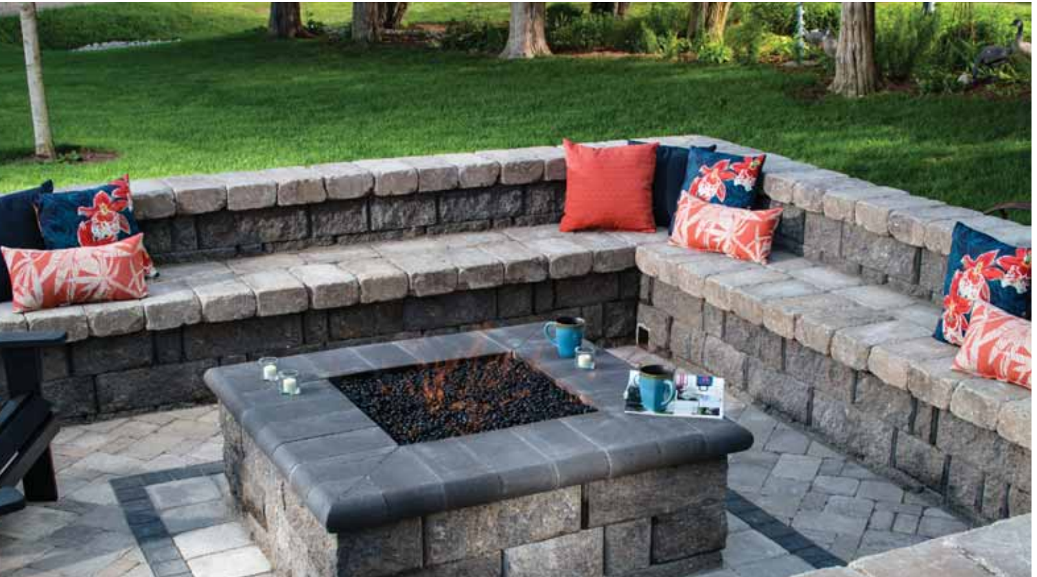
Dublin Cobble®/ Weston Stone®/ Anchor Highland Stone®/ Bullnose Coping