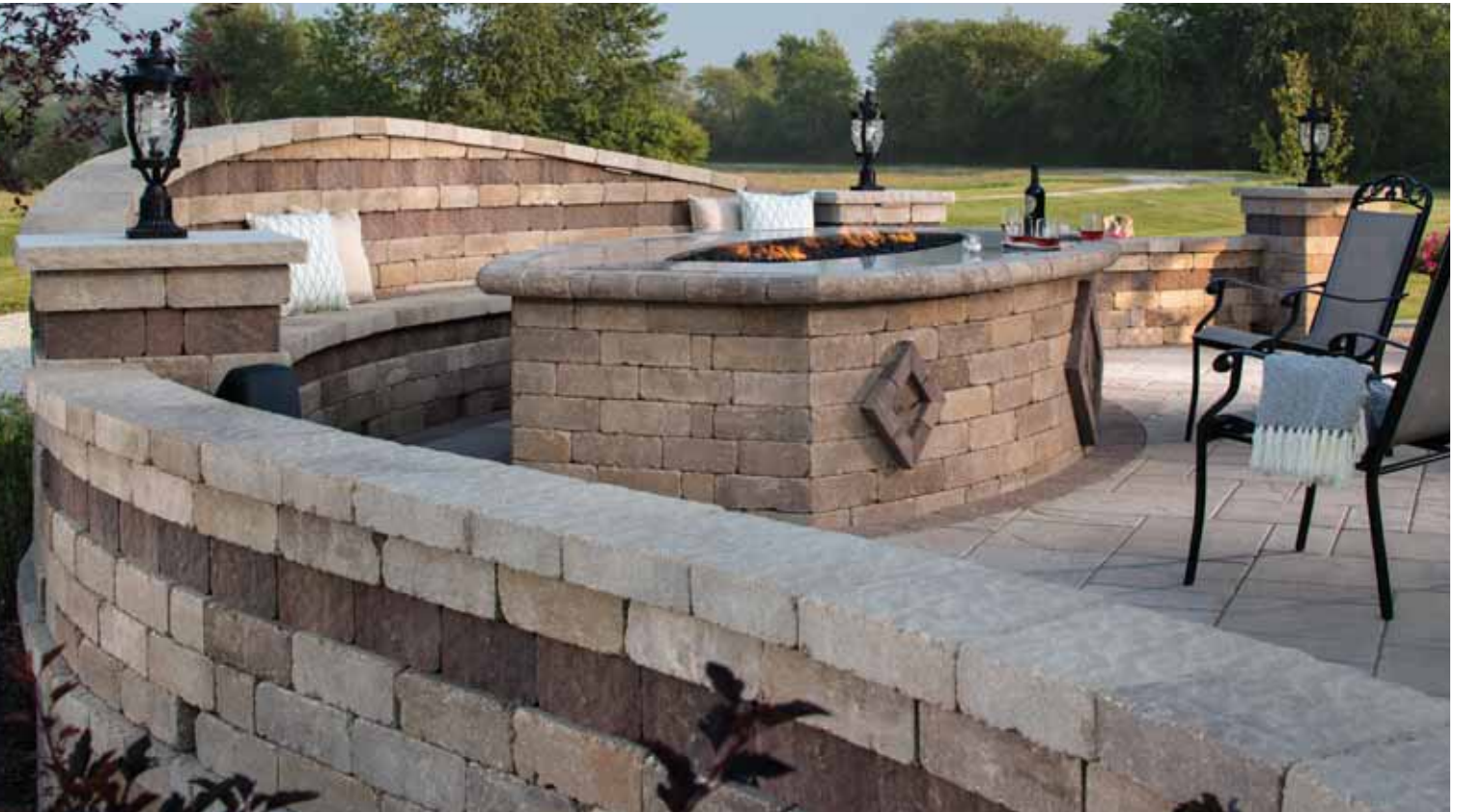
Weston Stone®/ Bullnose Coping/ Mega Stone Accents

» For more information about their limited warranty please go to at Belgard.com/GHseal