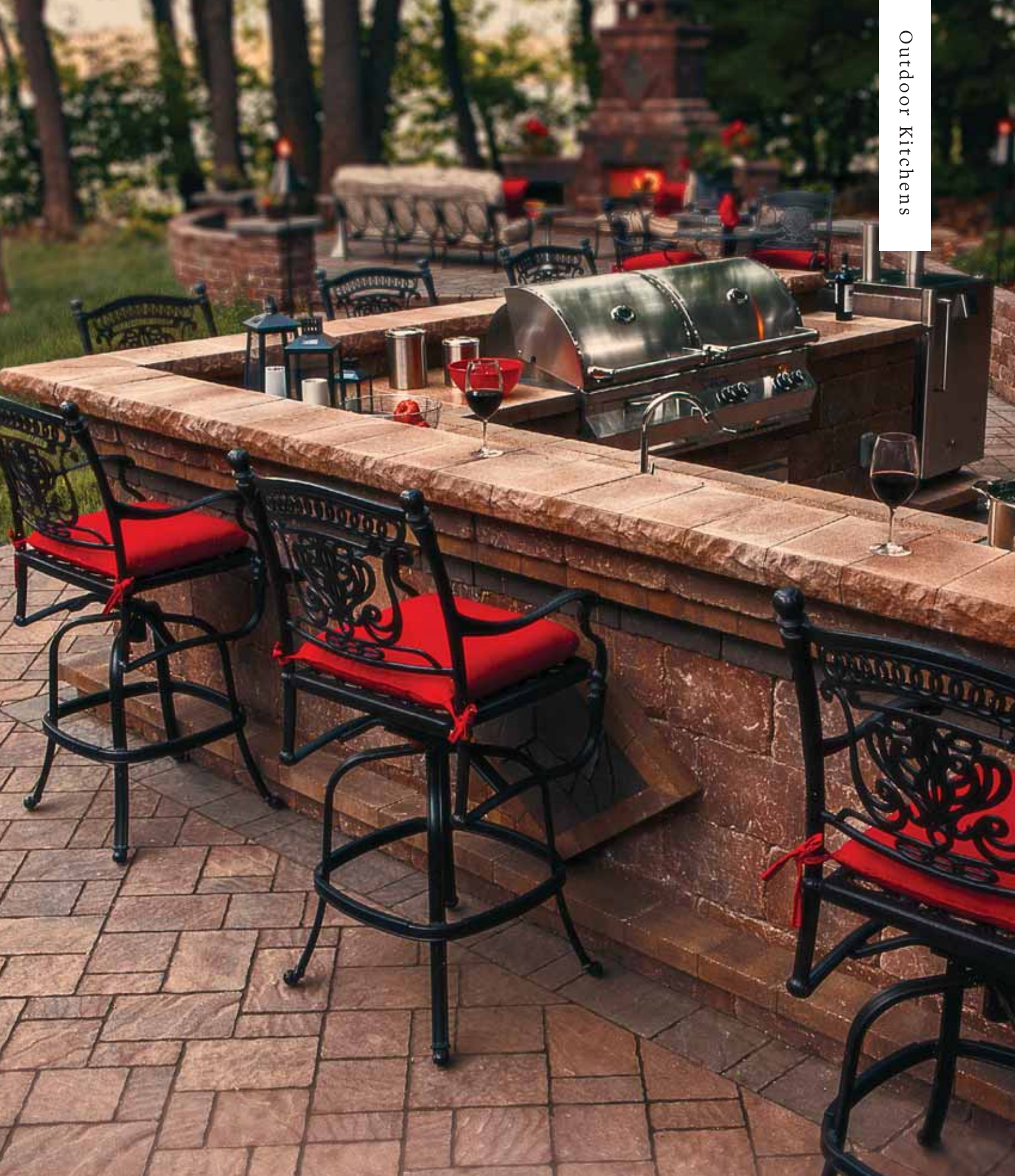
Urbana® Stone/ Weston Stone®/ Belair® Wall Cap/ Belgard Elements Bristol Fireplace