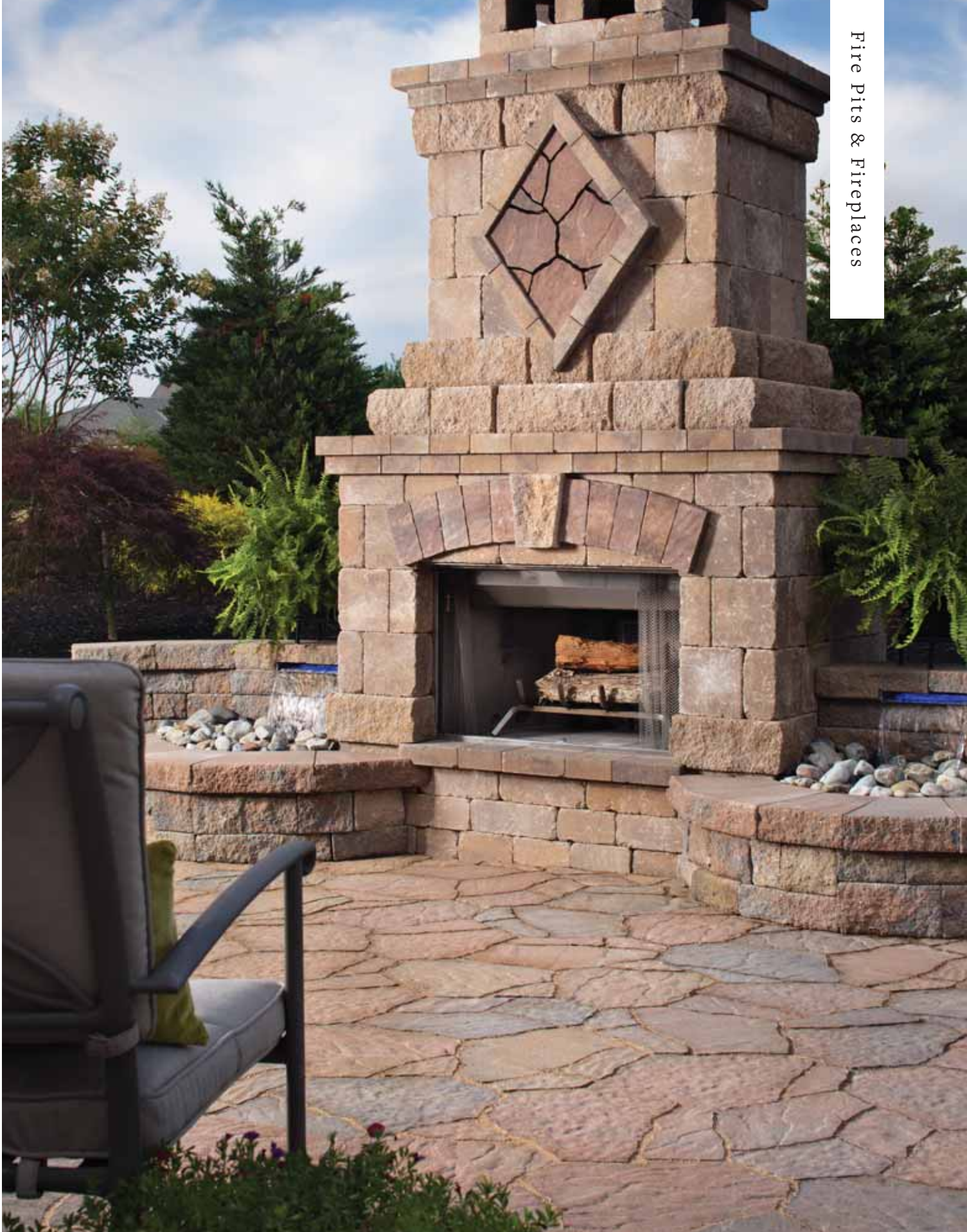
Belgard Elements Bristol Fireplace/ Mega-Arbel®/ Celtik® Wall