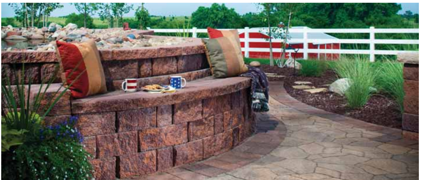
Anchor Highland Stone®/ Mega-Arbel®/ Urbana® Stone Border