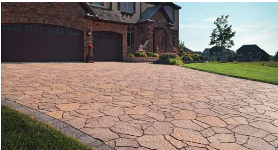
Mega-Arbel® with Urbana® Stone Border