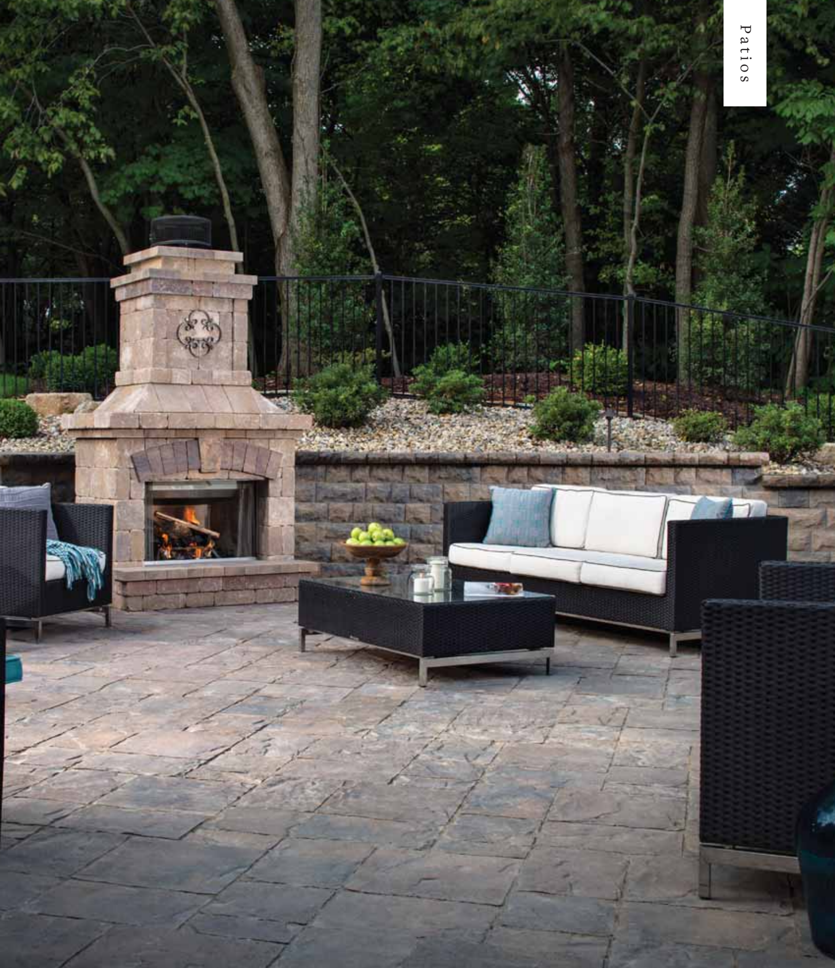
Mega-Lafitt®/ Belair Wall®/ Belgard Elements Brighton Fireplace