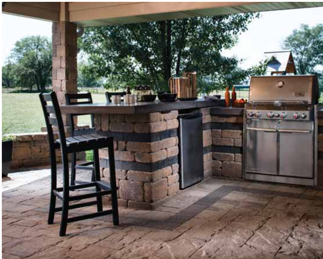
Mega-Lafitt®/ Weston Stone®/ Moduline Accents

» Find a local contractor at Belgard.com/Gallery